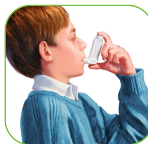
Inhaler in the mouth

TIP: A spacer makes it easier for some people to take their inhaler medicine correctly. Ask your doctor or pharmacist for help if you are having trouble using your inhaler.