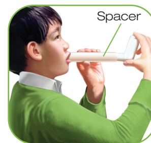
Inhaler with a spacer